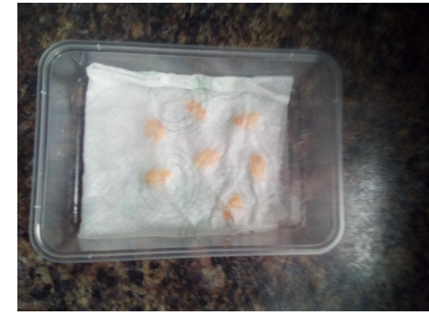
Enjoy your fruit and take out the seeds

For faster germination treat it like we did our Mung Beans only for 2-3 days