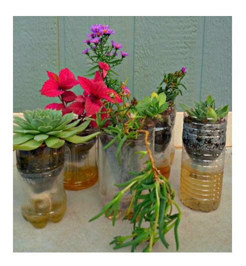
Step 1: Materials Needed